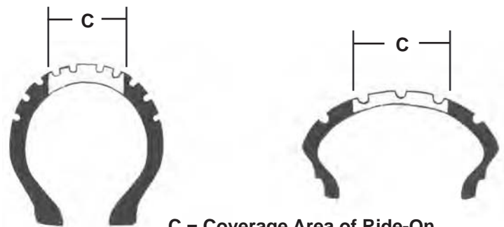
C = Coverage Area of Ride-On

Ride-On TPS will coat and help protect your tire’s contact patch with the road: